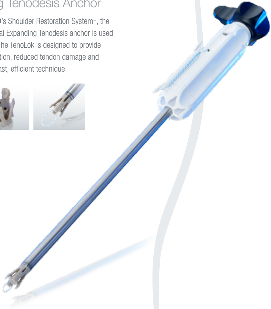
Y-KNOT™ RC ALL-SUTURE ANCHOR